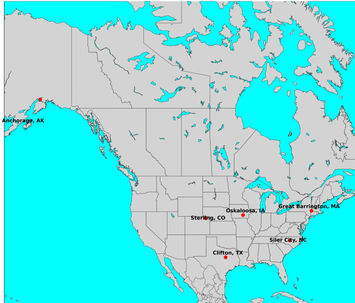
Figure 2. Map of Six Innovation Site Locations